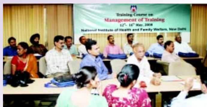
Participants in a group discussion: training course on Management in Training

No. Trained: 37 (NIHF-10, MOHFW-3, DPs-9, West Bengal-1, Andhra Pradesh-1, Rajasthan-1, Uttar Pradesh-2, Himachal Pradesh-6, Maharashtra-2, Delhi-2)