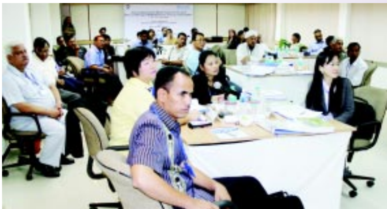
Participants of Regional Workshop on Immunisation

No. Trained: 38 (Delhi-28, Rajasthan-1, Maharashtra-1, UP-3, MP-4, TN-1)