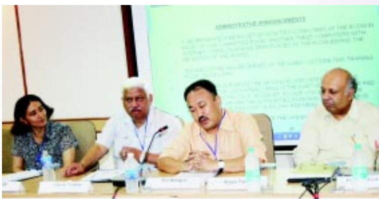
Inaugural session of Regional Workshop for Master Trainers for the use of Mid-level Managers' modules for training in Immunisation